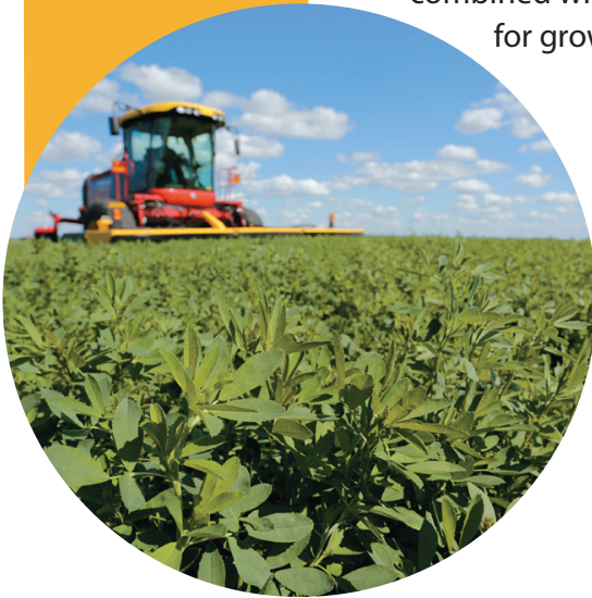
Stockpile's dense persistent stands make it a forage yield leader.

Stockpile is a true leader when it comes to performance. With its excellent quality, persistence and disease resistance package combined with consistent top yields, Stockpile is an excellent choice for growers who demand the most out of their alfalfa crop.